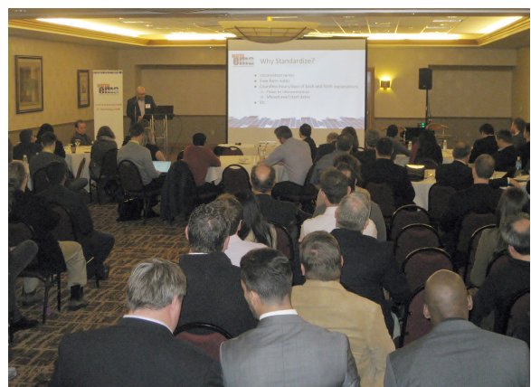
The Digital EMA Forum, held in conjunction with the 2016 Consumer Electronics Show, featured interviews with a digital retailer and a studio digital executive, updates on EMA's digital supply chain initiatives, and presentations on recent research on the digital video marketplace.