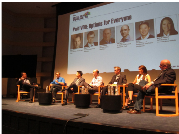
The seventh annual Digital Media Pipeline, held in Los Angeles in October, brought together 300 leaders in the online video industry to discuss release windows, business models, and the digital supply chain.

White Paper on OTT: The latest Digital EMA white paper — “Defining Over-the-Top Digital Distribution” — describes the OTT business models and identifies the major players in the sector. It is available at www.entmerch.org/digitalema/white-papers/defining-digital-distributi.pdf